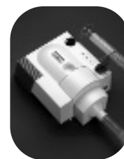
↑ Countertop/Tabletop Mount